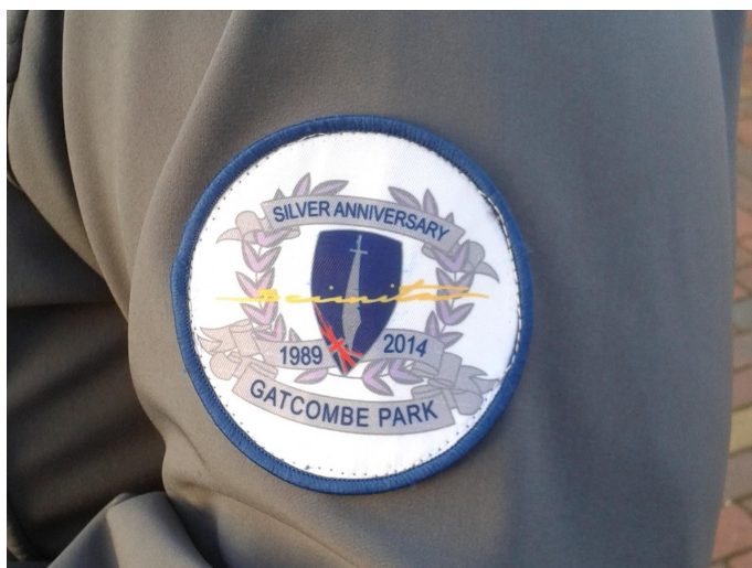
Gatcombe Sew on Badge