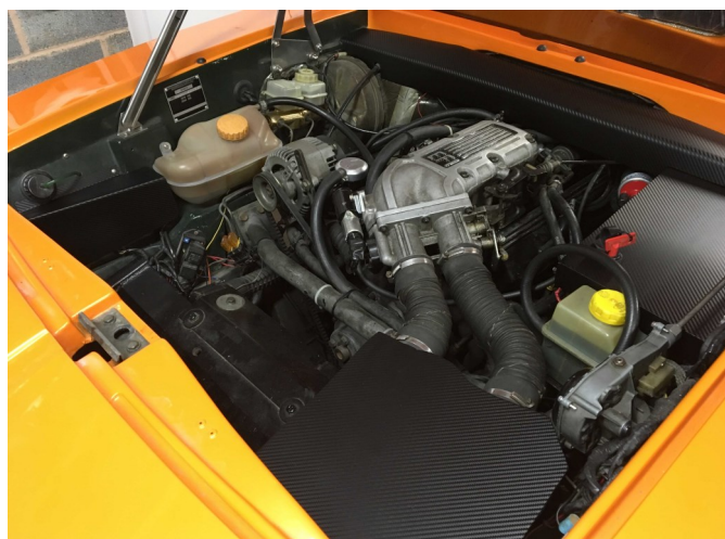
MB27's Tidy Underbonnet

Looking at keeping things under cover Pete Humphries has been making further modifications to MB27, this time under the bonnet. He had four separate covers made from plastic, aluminium and plywood to cover the airbox, battery, washer pumps and a splash guard to keep the water from the bonnet dripping onto the distributor when opened. Peter used the same process as Alan with vinyl material to wrap the covers and although he was expecting some problems with the under bonnet temperatures, and wondering if he would have to remake them in fibreglass if the wrap lifted, everything seems to have stayed intact for now.