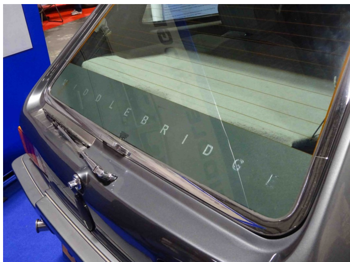
MB50's Parcel Shelf

At the Manchester Classic Car Show, I saw probably the most ingenious load cover so far on Alan Timmis' MB50. Alan had taken a parcel shelf from a scrap car and fitted it with wooden brackets to raise the cover to the height of the back seats. Great, you might say, but surely that just means folk can see in through the rear window under the shelf. Well, that would be the case but Alan got a company to make a vinyl strip for the rear window which is the same depth as the visible area of the screen. He also had the company cut out letters which were then backed with a silver vinyl material giving a nice finish. The good thing about this is that you don't really lose any rearward vision but do gain a useful extra loadspace.