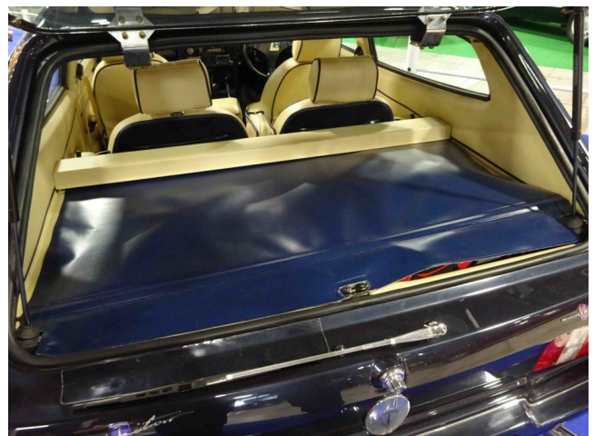
MB26's cover made with the mechanism of a self retracting roller blind

The subject of load covers has never really bothered me. I was aware that there was a standard cover and I had seen several alternatives made by owners over the years but I have always just carried a blanket to throw over the luggage if we are travelling. However, I can see the benefits of hiding whether there is anything being carried at all. The standard load cover follows the moulding in the inner rear panels and that means that the depth of the loadspace is fairly limited.