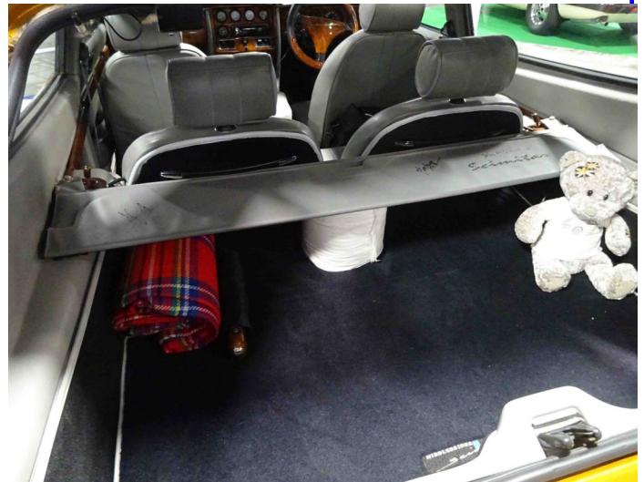
MB33's Standard Load Cover

It would be great to hear from anyone that has any ideas on the above.