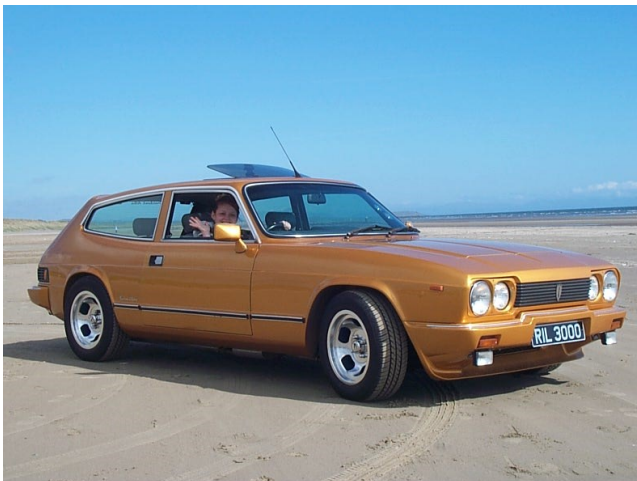
MB33 on a beach holiday, Bettystown. Co Meath