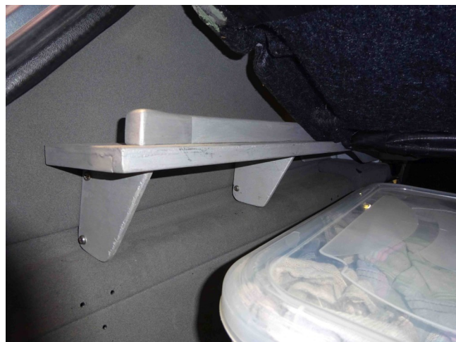
MB50's Parcel Shelf Supports

Unfortunately he can't remember the make of car the parcel shelf came from but just went armed with a tape measure and got one that fitted so he reckons they must be relatively easy to find.